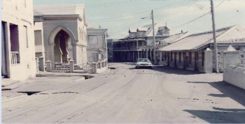
Parliament Street – (Plymouth)